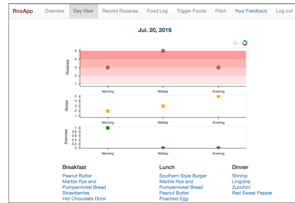
Figure 1: RosApp "Day View", showing visualisations of rosacea (top), stress (middle) and exercise (bottom) log data. Meals and snacks listed at bottom.

We designed RosApp to enable users to track their rosacea and identify triggers relating to food, stress and exercise. The primary emphasis of RosApp is on food, with the other factors currently holding a secondary position. Rather than implement food tracking directly, we built upon an existing food diary. We chose the FitBit food diary for this because it has a relatively open API (as opposed to apps such as MyFitnessPal). In this way, users of RosApp can use the FitBit food diary to log meals and snacks, and these are automatically imported into RosApp .